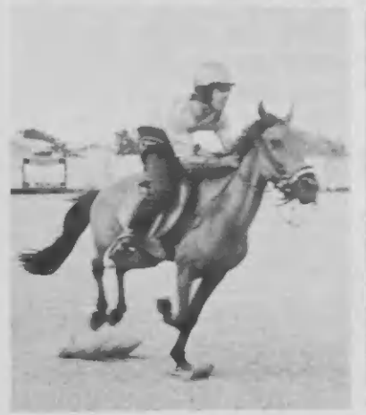
Horse-racing at Wilhelmina Stadium